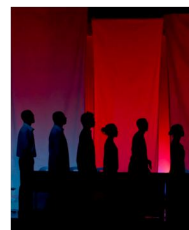
Compagnie Miangaly Théâtre Antananarivo, Madagascar